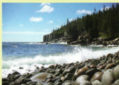
Otter Cliffs Cobblestone Beach