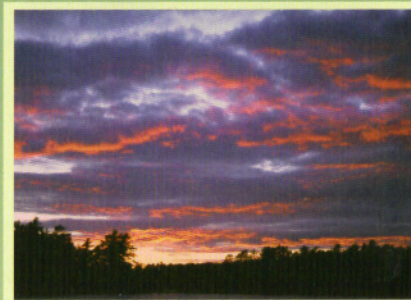
Spectacular Acadian Sunset

We are ideally located between Bar Harbor activities, shops and restaurants and the Ocean Drive entrance into Acadia National Park, where you will experience the spectacular scenery of oceans, mountains, lakes and ponds.