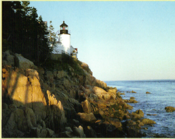
Bass Harbor Lighthouse

Our guests treasure the peaceful country setting here on the quiet side of scenic Bar Harbor. A ten minute stroll will find you in downtown Bar Harbor.